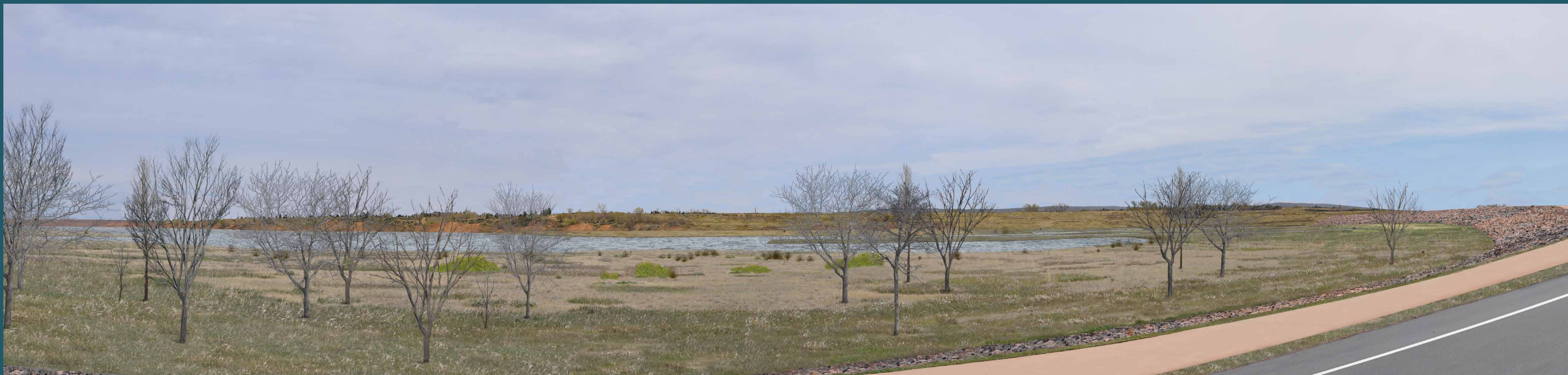
Post Reallocation - Water Level at 5432': Simulation depicts tree clearing up to 5439' and conceptual mitigation approximately 5 years after implementation.