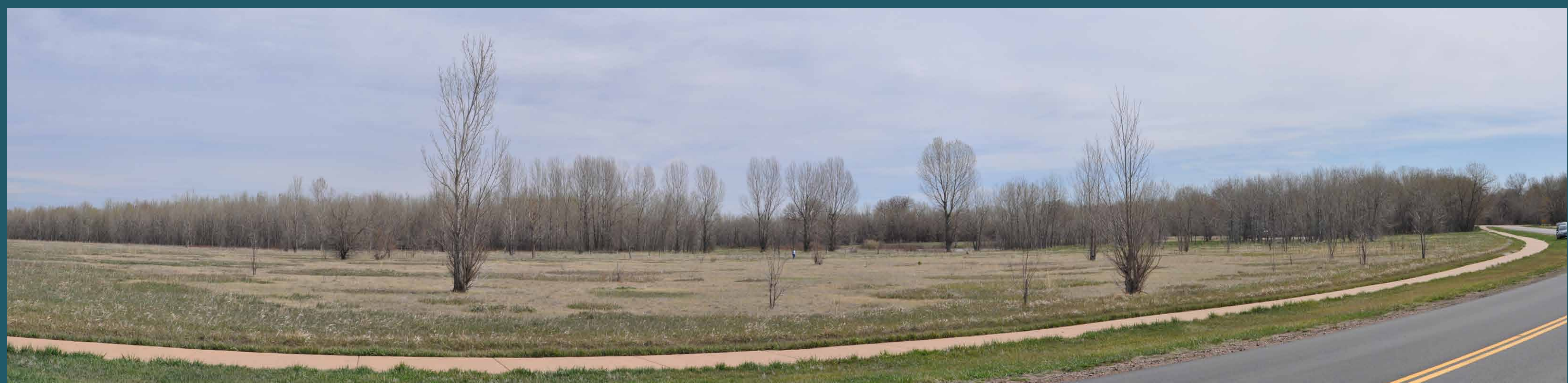
Existing Conditions: View from the Park Road looking towards the reservoir in the Kingfisher Area