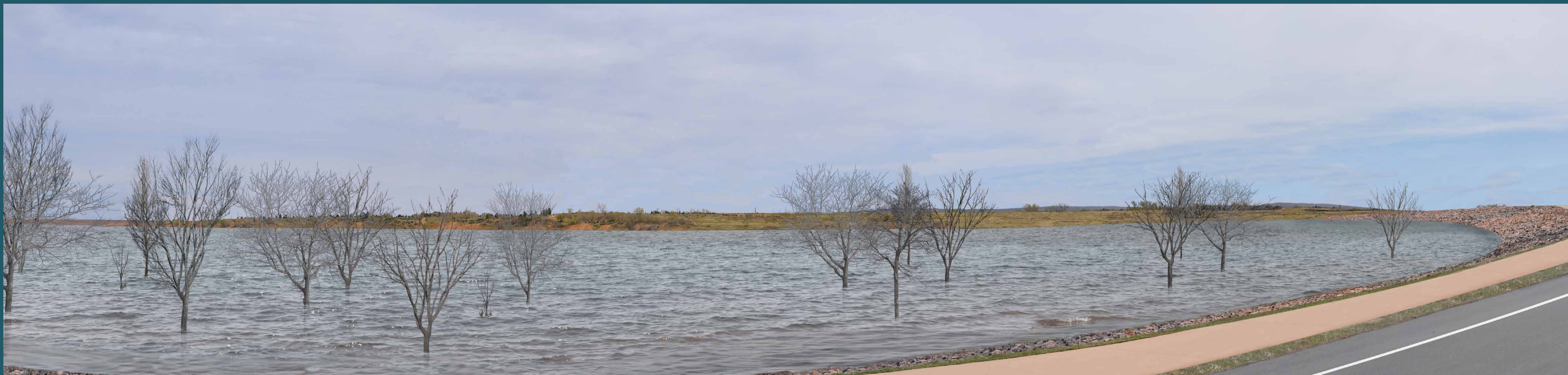
Post Reallocation - Water Level at 5444': Simulation depicts tree clearing up to 5439' and conceptual mitigation approximately 5 years after implementation.