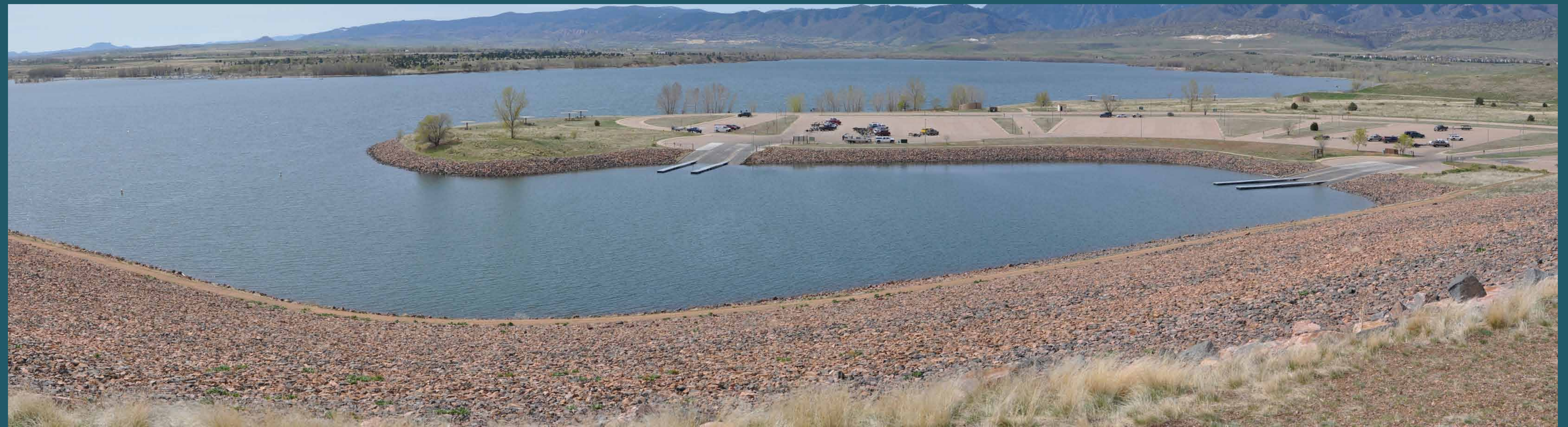
Existing Conditions: View from the Dam Overlook towards the North Boat Ramp with the water level at approximately 5432'