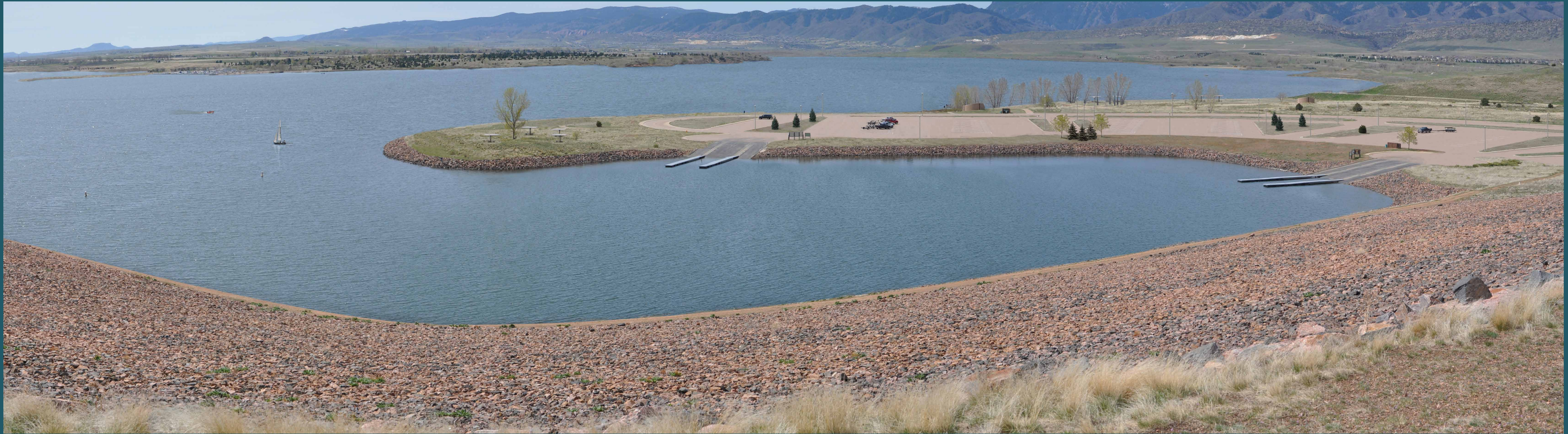
Post Reallocation - Water Level at 5444': Simulation depicts tree clearing up to 5439' and conceptual mitigation approximately 5 years after implementation.