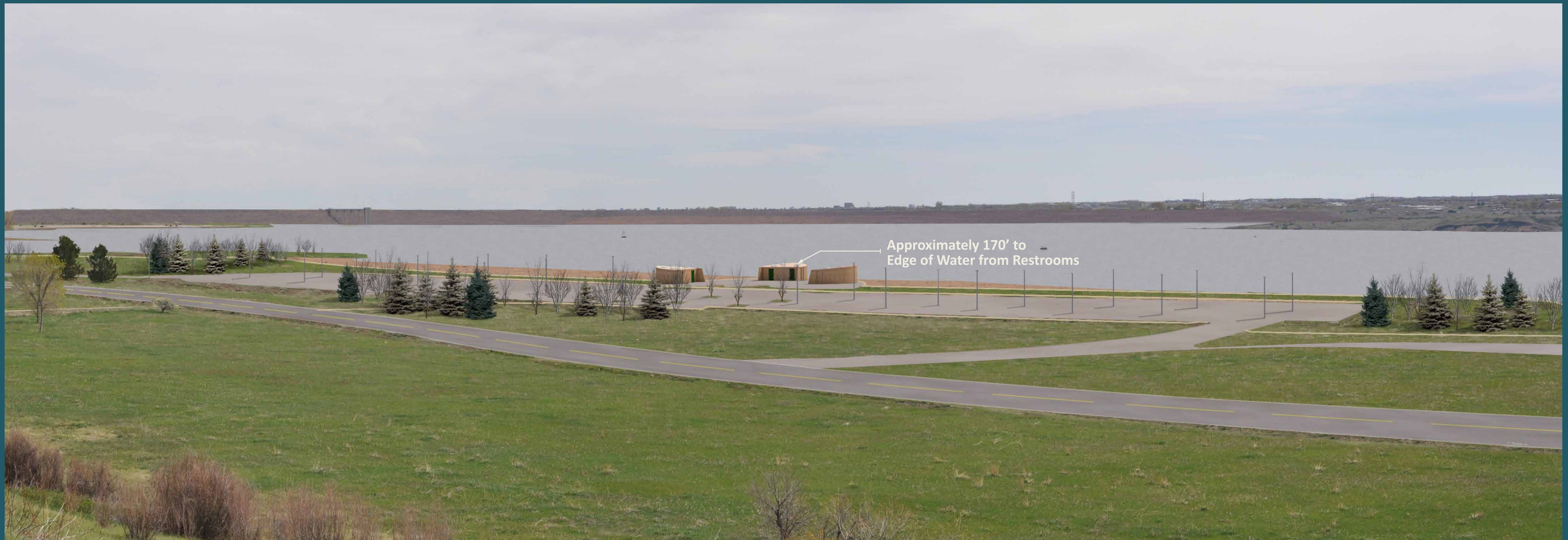
Post Reallocation - Water Level at 5444': Simulation depicts tree clearing up to 5439' and conceptual mitigation approximately 5 years after implementation.