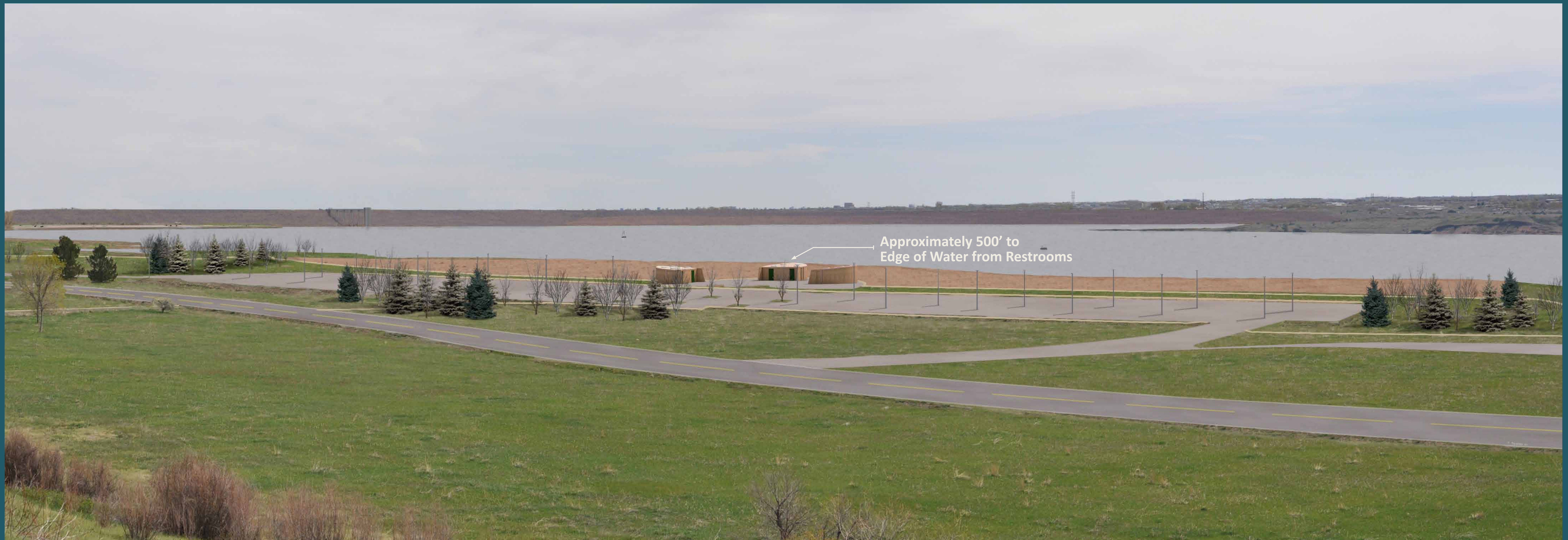
Post Reallocation - Water Level at 5432': Simulation depicts tree clearing up to 5439' and conceptual mitigation approximately 5 years after implementation.